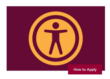
Figure 15 Logo of the accessible Media Production Program at Mohawk College.

Accessible Media Production Program, Mohawk College, Hamilton ON1