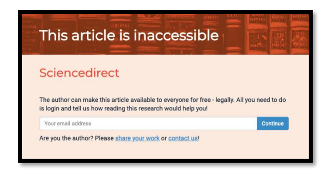
Figure 12 A notification that this article is not accessible.