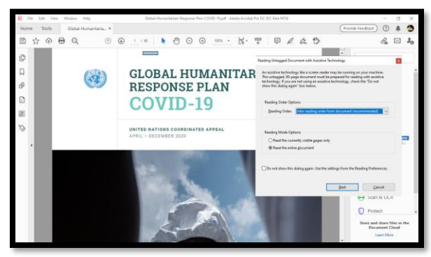
Figure 4 UN COVID-19 Planning Guide in inaccessible PDF format.