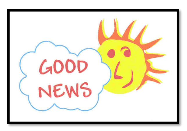
Figure 11 A drawing of the sun saying "Good News"