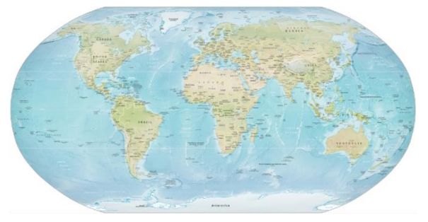
Figure 1 Map of the world

Karen McCall, M.Ed. Karlen Communications Copyright 2020