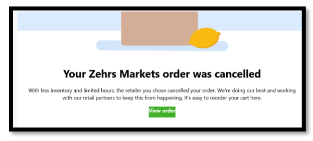
Figure 9 E-mail from grocery store saying my order had been cancelled.