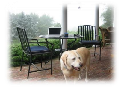
Figure 7 Bistro patio set with woods in background, computer on the table and dog walking around.