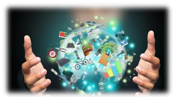
Figure 10 Hands holding the world with small icons for things. Internet of Things MUST be Internet of Everyone.