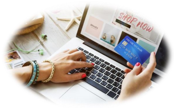
Figure 8 A laptop showing a shopping web page someone typing in credit card information with one hand while holding the credit card with the other.