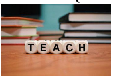
Figure 14 The word "Teach" in building blocks in front of two stacks of binders.