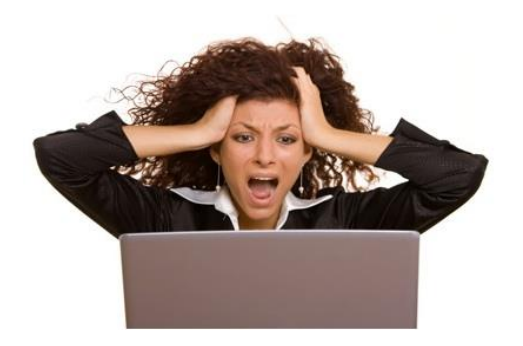
Figure 2 Person in front of a computer, frustrated, screaming, hands on head.