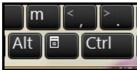
Figure 2 The AppKey on a regular keyboard.

If you are using Narrator or your computer without a mouse, you will want to use the AppKey or Application key which gives you the equivalent of a right mouse click. The AppKey is usually found in the lower right of the keyboard on a regular keyboard to the immediate left of the Ctrl key. It has what looks like tiny applications or documents on it. You may not have this key on a laptop computer. If not, try Shift + F10 which does the same thing but I find that if you have an AppKey it works in more places and more reliably.