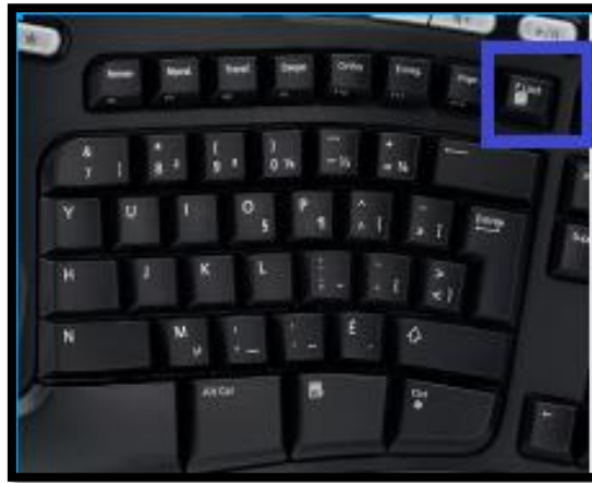
Figure 3 F13 key on a Microsoft Ergonomic keyboard.

If you are using a Microsoft Ergonomic keyboard with Narrator or any type of adaptive technology you might notice that there is an F13 key on the far right of the Function key row. This key toggles the functionality of the Function keys for use by adaptive technology (or as Function keys) on or off. If you are using this keyboard and all of a sudden your Function keys aren't responding, try pressing the F13 key to toggle back to the "Function key mode."